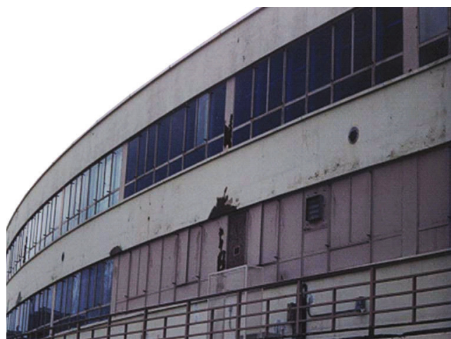
Fig. 3: Deteriorated concrete façade prior to repair

Completing this work allowed the building to remain in service (Fig. 5). As a result, 6755 yd 3 (5165 m 3 ) of concrete were maintained in service and a comparable quantity of new concrete was not needed to rebuild a similar structure. This prevented the release of 1688 tons (1,531,000 kg) of CO 2 (equivalent to the annual emissions of 335 people) and 67 tons (61,000 kg) of acid rain constituents (SO 2 and NO x ). In terms of thermal pollution, maintaining the existing structure prevented the release of 17,000 MMBtu (18,000 GJ) of heat into the environment. These quantities do not include the impact or contribution of demolition and disposal activities.