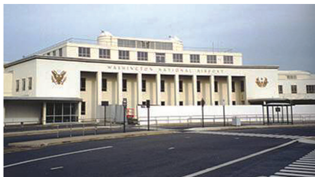
Fig. 5: Restored structure