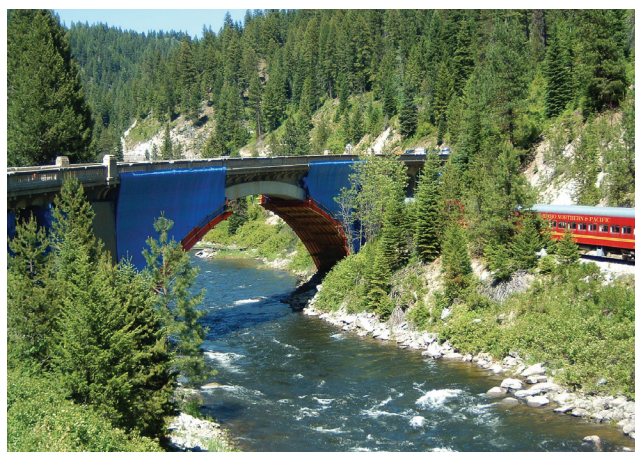
Fig. 6: Rainbow Bridge during rehabilitation

The embedded energy in this quantity of concrete is approximately 4550 MMBtu (4800 GJ), or enough heat to boil the water in three Olympic-size swimming pools.