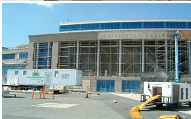
Fig. 4: Installation of realkalization system